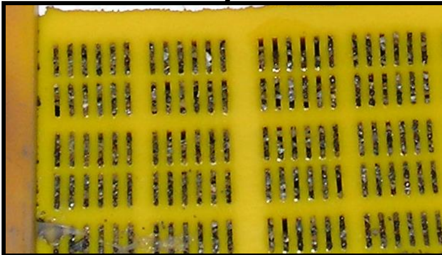
██████████, apertures 2,5 X 16 mm. (Previous supplier)